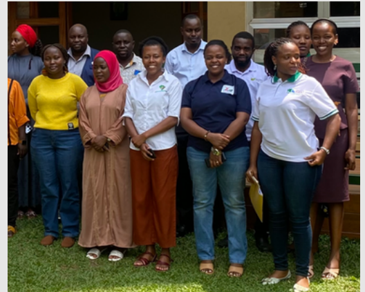
Group photos with partners attending strategic meetings