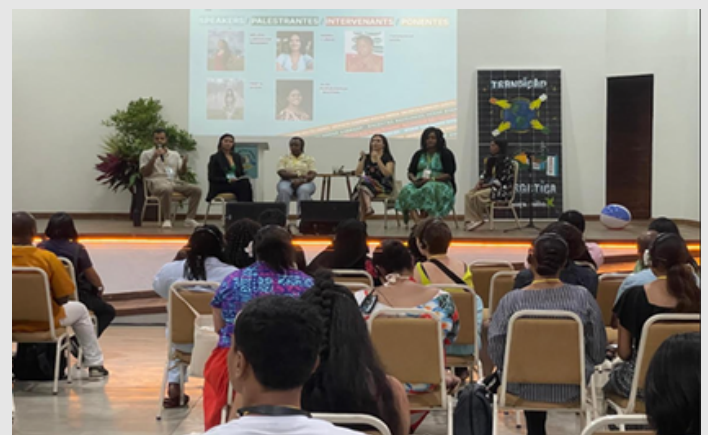
Global exchange learning with other activists in Brazil 2025. Our ED sharing stories of communities on how EACOP affected them and how there surviving amidst the injustices.