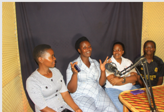
WOGEM team together with community mobilizers in oil host communities on Kazi Jema radio highlighting the impacts of EACOP project on marginalised women