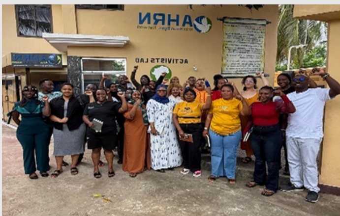
WOGEM team lead attending the training of trainers on the feminist influencing basket in Tanzania.

We actively participated in several external meetings, conferences, and policy dialogues at national, regional, and international levels. These spaces were crucial for influencing decision-making processes, amplifying community voices, sharing our research findings, and building solidarity with like-minded movements.