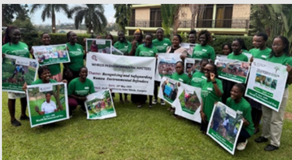
WoGEM team together with Women Human rights defenders celebrated World Environmental Day