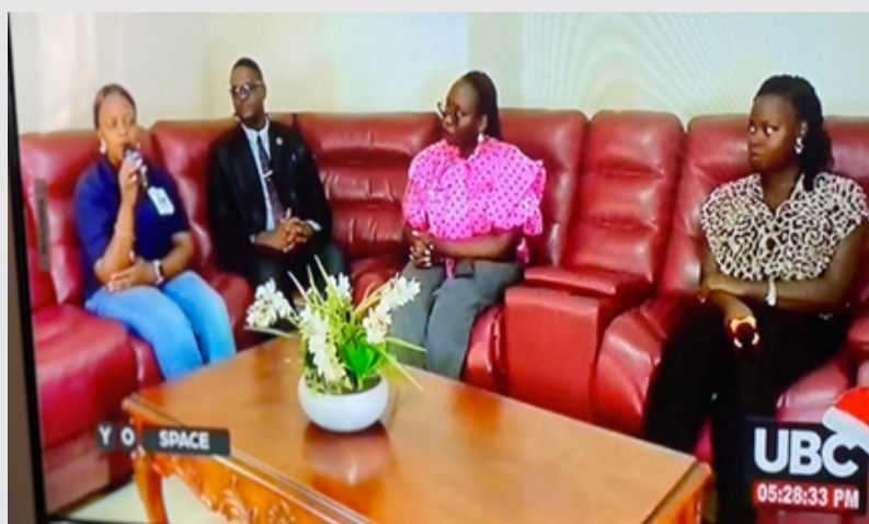
WOGEM team on UBC TV highlighting the impacts of Climate change on marginalised women in December last year.